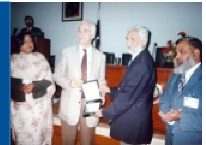
MoU Signing Ceremony of CSP With NADRA on 12-02-2007