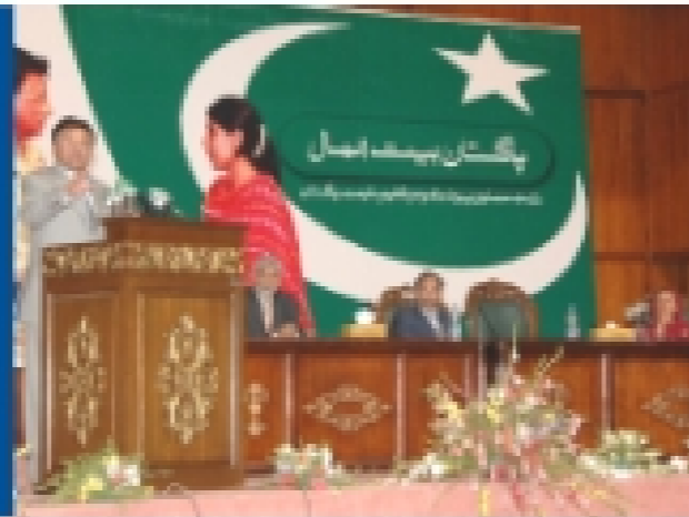
Air University Macro Economics students visited Pakistan Bait-ul-Mal on 02-05-2007