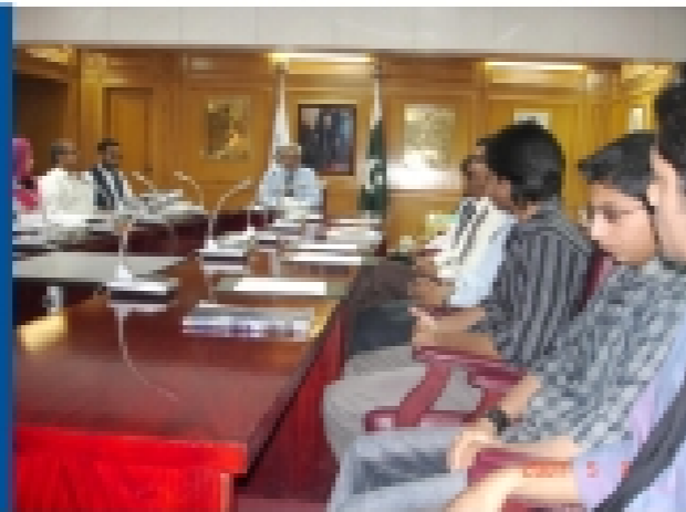
Group photo of 47th Board of Management meeting participants on 15-05-2007