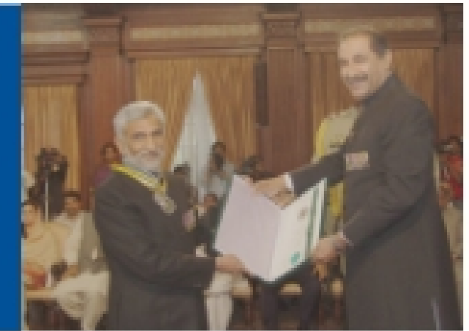
Executive Director PIMS awarding shield to MD PBM at PIMS Hospital on 03-02-2007.